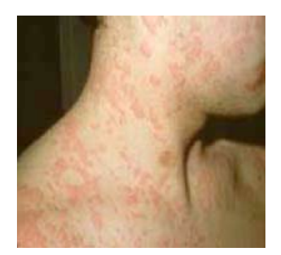
▶ Nettle rash

These photographs are included only as a guide to show how some students may react. The symptoms in these pictures may not be present even though anaphylaxis is occurring.