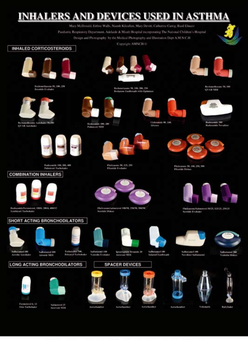
Published with an Educational Grant from the Asthma Society of Ireland

A compressor is a machine that turns liquid medication into a mist that is then breathed in through a mask or mouthpiece. Normally students do not need to use a nebuliser/compressor at school because asthma control is maintained using inhalers and spacer devices.