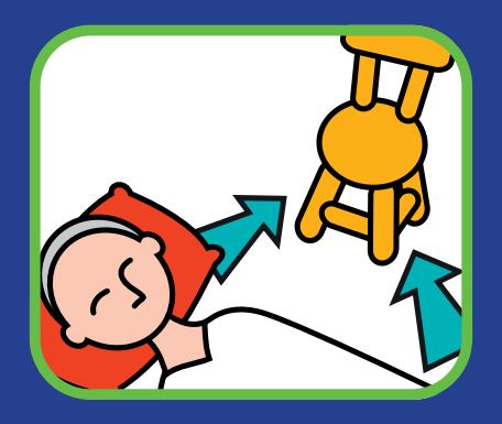
2. DO remove any harmful objects