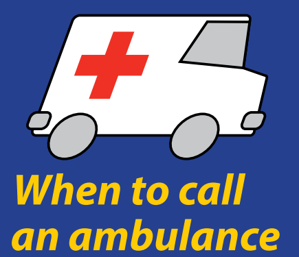
If the seizure is longer than 5 minutes