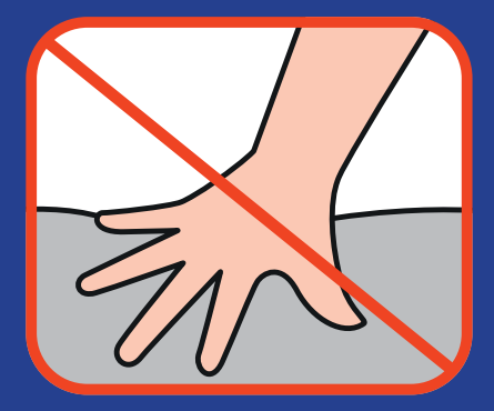
6. DON'T restrain the person unless in danger