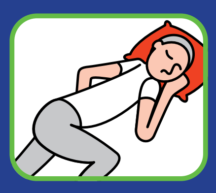
7. DO Place the person into the recovery position when the seizure ends