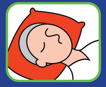
3. DO cushion the head