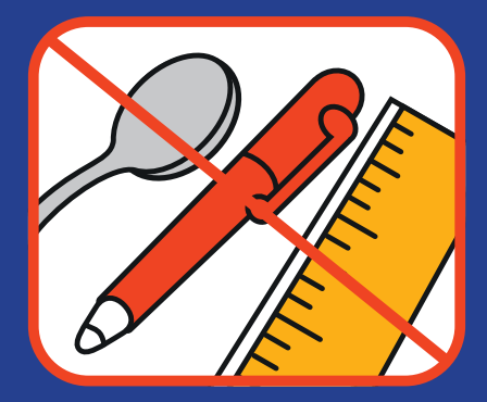
5. DON'T put anything into the person's mouth